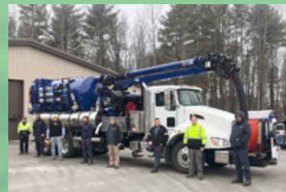
Pictured here are the district's collection crew and representatives of CN Wood of Woburn, MA.

This vacuum-sewer cleaner is one of, if not the most, important pieces of equipment in our fleet. It will help us be more efficient in our operations, enable more production and cleaner sewers, and perhaps best of all, will be much quieter. When you see us around town, please wave and show your appreciation.